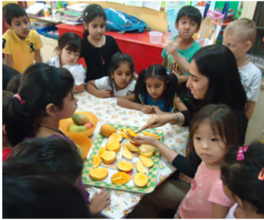
Relishing the king of fruits "Mangoes"