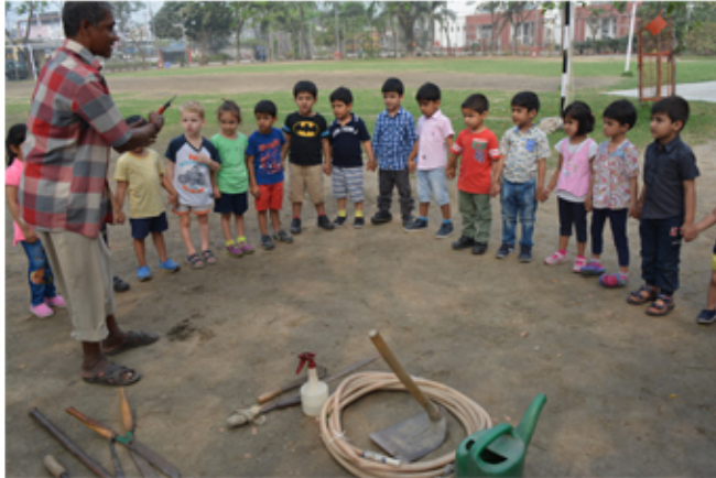
Children learnt about various tools used for gardening. An Interaction with the school gardener was arranged. He displayed his garden tools.