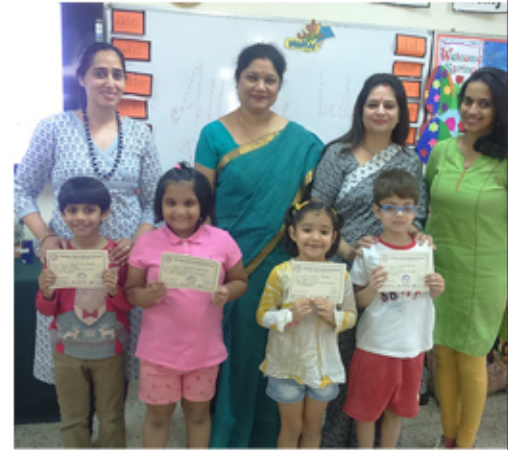
Winners of the Elocution competition of UN-A