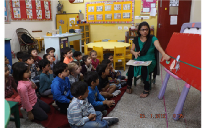
Children are engrossed in a flannel board story. They learnt how a plant grows into a tree from a seed.