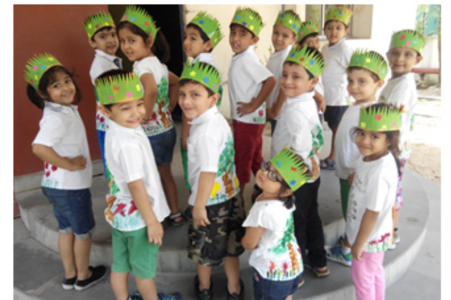
We reused old t-shirts by painting a tree on it. They used an old tooth brush for painting the trunk and sponges for the leaves and the flowers.