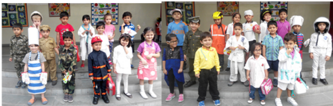
The tiny tots of Pre Nursery came dressed as "Community Helpers" by dressing up as fire fighter, milkman, astronaut, bus conductor, engineers, soldiers etc.