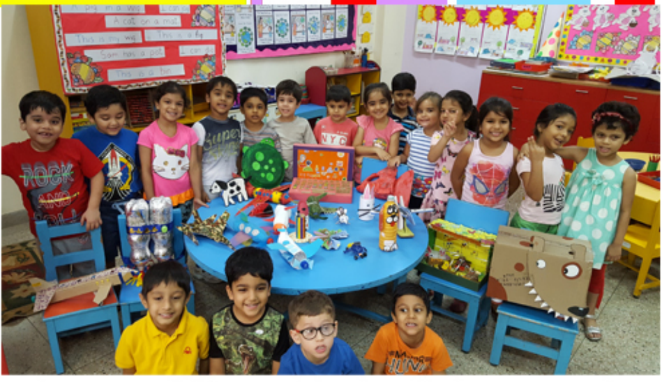
The Nursery children made lovely crafts by reusing and recycling materials