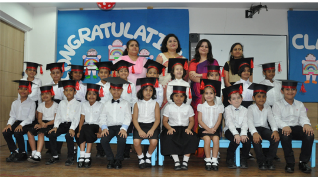
The Graduation ceremony of Upper Nursery was held on 29th April, 2016. It was a grand event with parents and grandparents gracing the occasion with their presence.