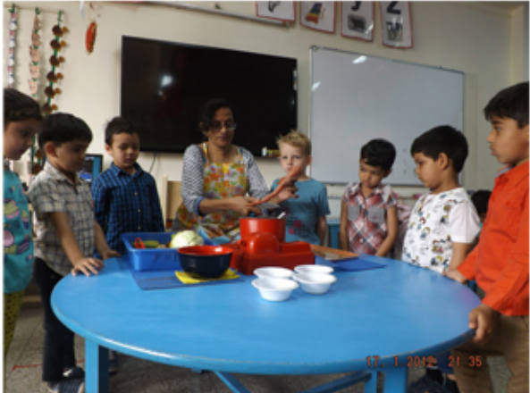
Teacher demonstrates while narrating the soup story where vegetables were used. The story was titled "The stone soup".