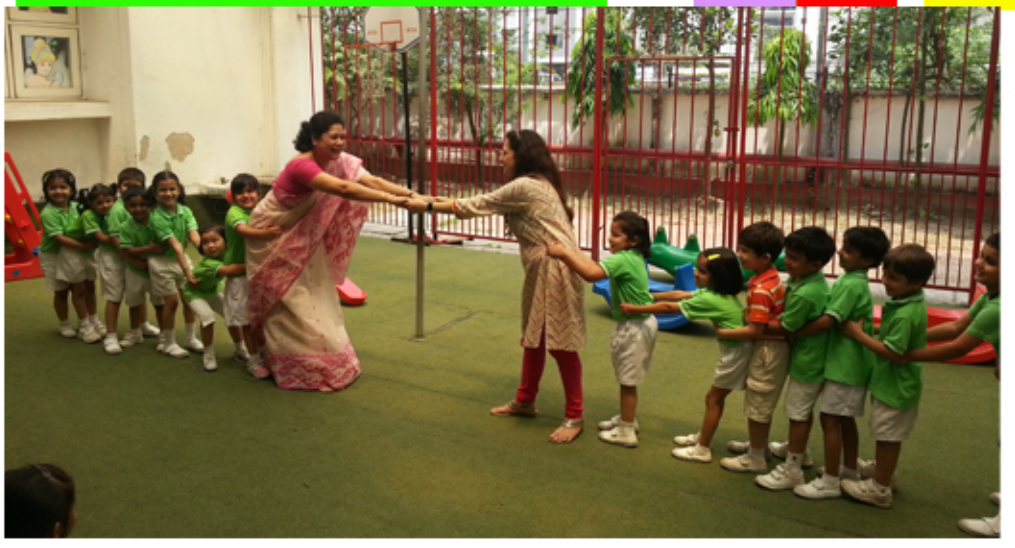
The little champions enjoyed playing "tug of war" with their teachers